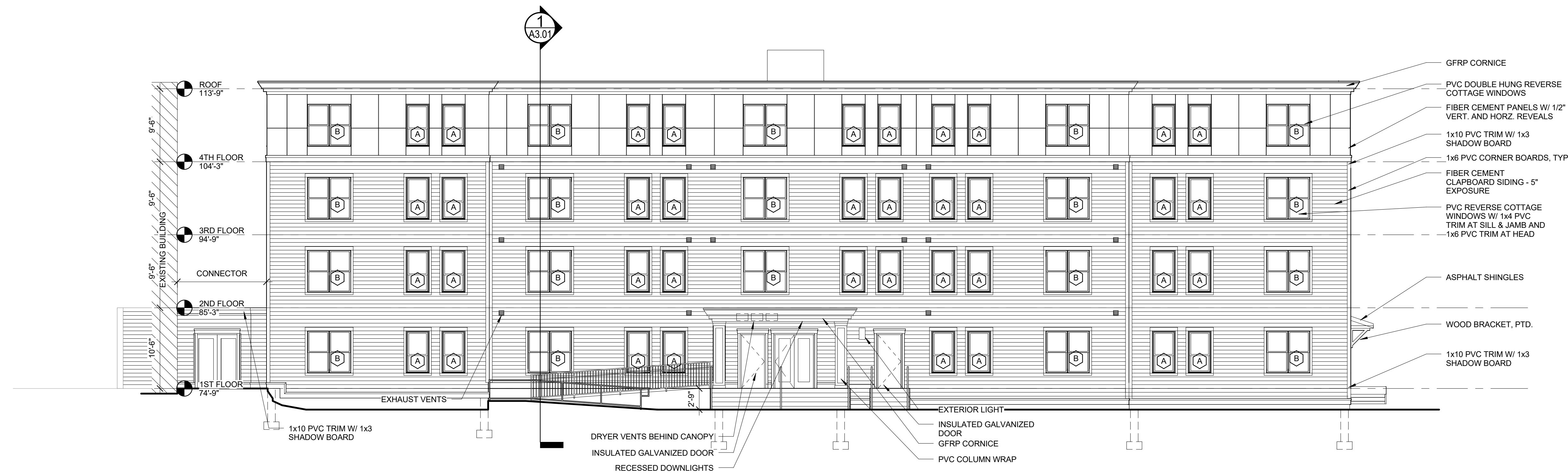
3 | NORTH BUILDING ELEVATION 1/8" = 1'-0"