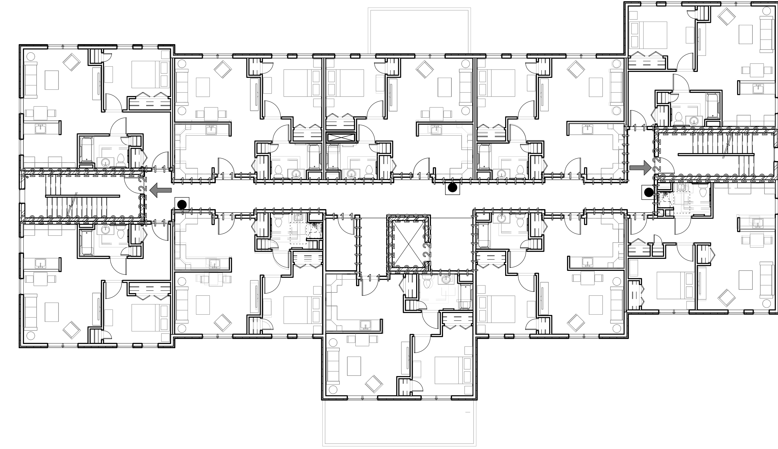
3 | 3RD FLOOR 3/32" = 1'-0"